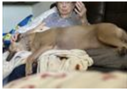
Gavin - December 04, 2025 at 05:25 PM